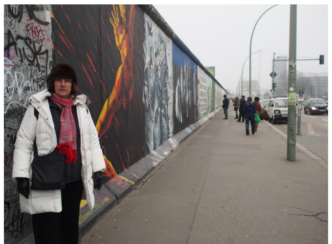
Section of the Berlin Wall Dec 2013

‘A person who thinks only about building walls, wherever they may be, and not building bridges, is not Christian.’ (Pope Francis).