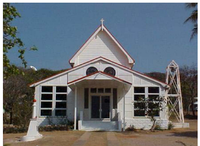
Thursday Island Church

One of the blessings in the Diocese of North Queensland is that we have diverse cultures and our meetings are enhanced by the insights, contributions and spirituality of our indigenous members. It was a great blessing for us to travel around our beautiful Diocese. The time taken to travel to all of our areas was very worthwhile.