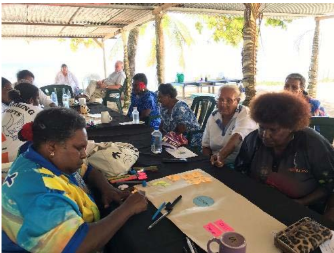
Working hard at Mer Is.

Members were pleased that we were able to visit them and we enjoyed the experience as well. It again reinforced for us the cost in both time and money that our sisters have to commit when they travel to meetings and our yearly Conference. We hope to do another trip next year (God willing), to again visit with these vibrant and faithful members of Mothers Union.