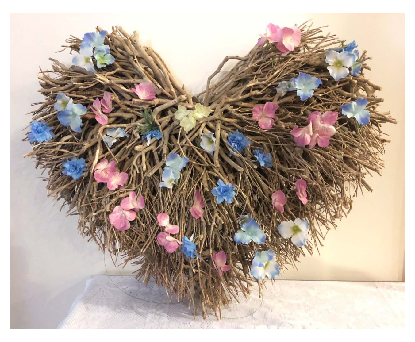
One of the ornaments on the western wall of the church

Because the Parish does not have a Priest or Locum Priest currently, there is no report this year.