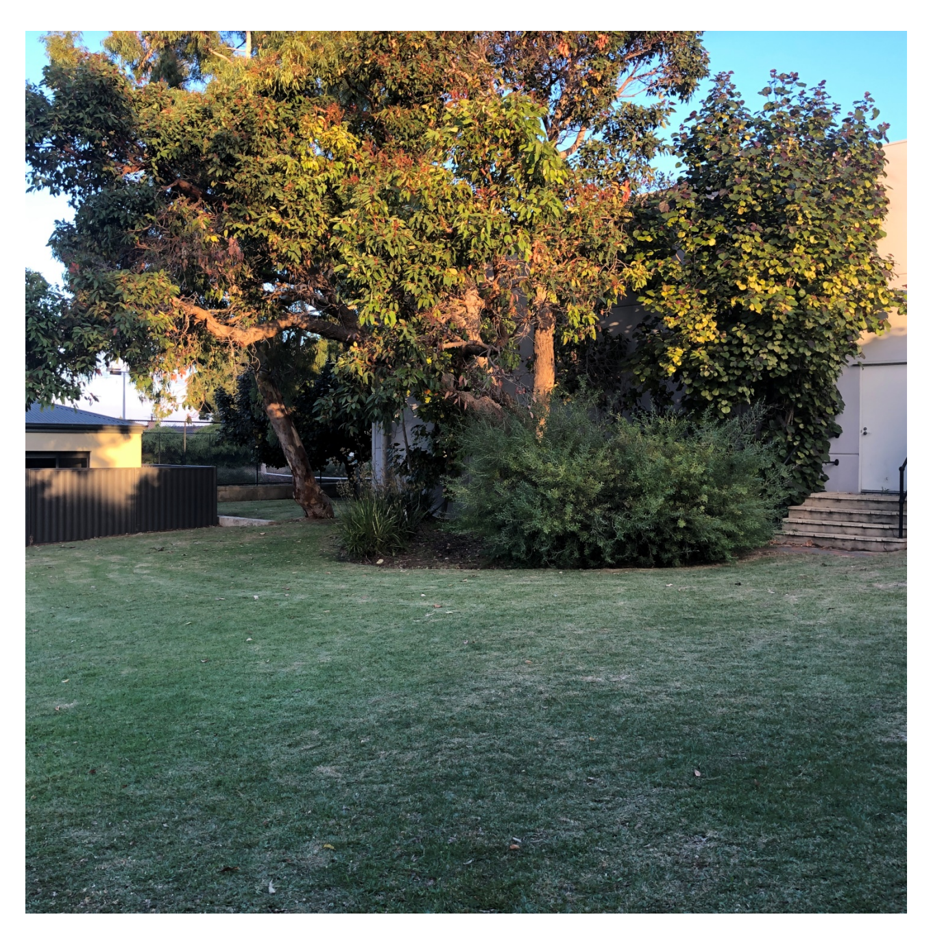
Back Cover Photograph: Gardens at the rear of the church

ANGLICAN CHURCH of the HOLY CROSS A.B.N.: 97 864 975 166 56 McLean Street, Melville Western Australia 6156