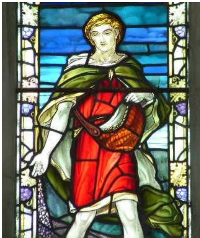
Stained Glass Window from St Mary's Church, Sth Walsham

"This is the meaning of the parable: The seed is the word of God" (Luke 8: 11)