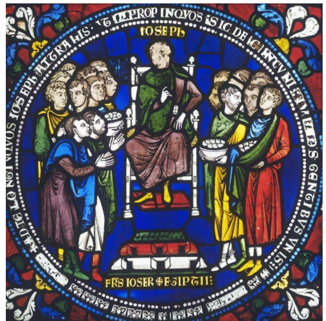
Joseph and his Brethren, Canterbury Cathedral

Whatever is our personal need, the life of Joseph gives us hope. God will never abandon those who belong to Him.