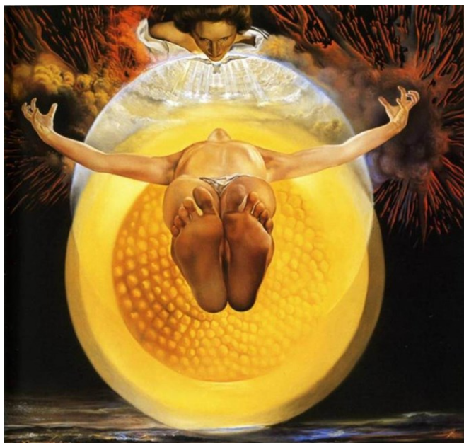
Salvador Dali "The Ascent of Christ" 1958

In Salvador Dalí's picture of Jesus' ascension all you can see are his feet! As we celebrate the event this month, it prompts the question 'where did Jesus go?' Peter says Jesus 'has gone into heaven and is at God's right hand' (1 Peter 3:22). However, the New Testament tells us three things about what Jesus is doing at the Father's side.